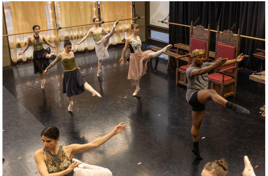
Artists of Ballet Fantastique in Robin Hood world premiere rehearsals at the Ballet Fantastique studios, April 2023

Ballet Fantastique is thrilled to have such a talented and diverse team of collaborators and local and international creatives working together to bring this exciting new production to life.